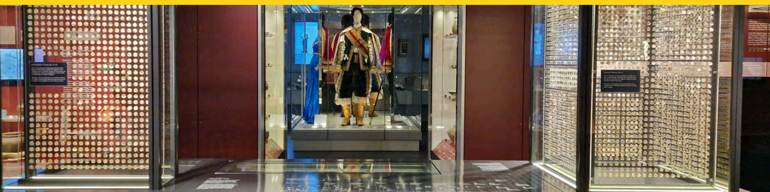
The Lenborough Hoard